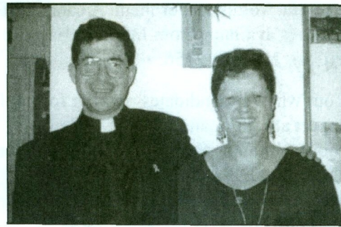
Fr. Frank Pavone with Norma McCorvey, the former "Jane Roe" of the Supreme Court's abortion decision Roe vs. Wade. Norma is now pro-life, and Fr. Pavone received her into the Catholic Church in 1998.

Checks should be made payable to "Priests for Life."